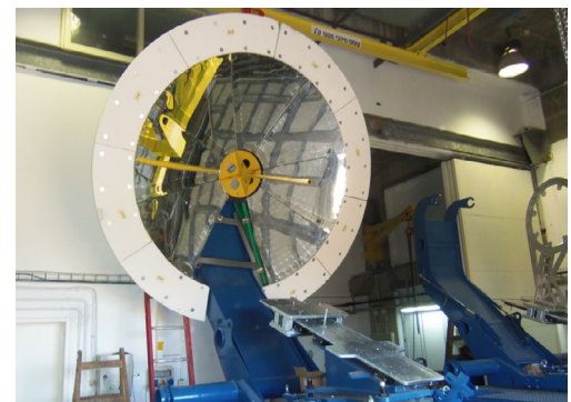
Solar mirror that is used to concentrate the solar energy