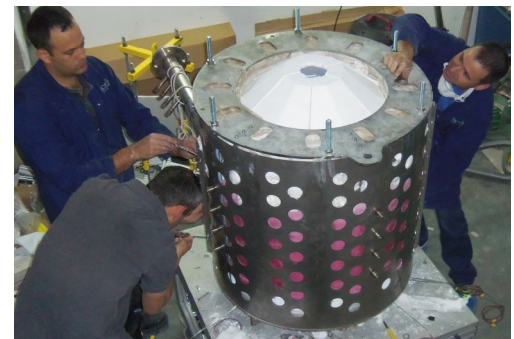
NCF's team working on the assembly of the technology demonstrator

In addition, many visitors have had the opportunity to visit the solar testing facility where the technology demonstrator is located, and to see the current NCF design as it materializes.